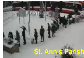
St. Ann's Parish

The Out of the Cold completed its 2023 - 2024 season on Thursday April 18th. In 23 weeks, from November through April, we served 2429 hot meals to our grateful guests at St Ann Parish. We also distributed socks and personal